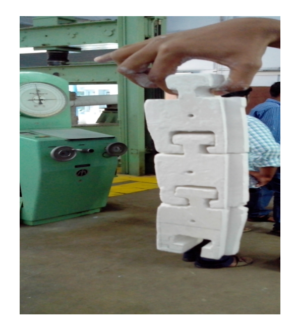
Fig.2 shows the 'T' projection in the model of interlock block that we did at (itmadras)