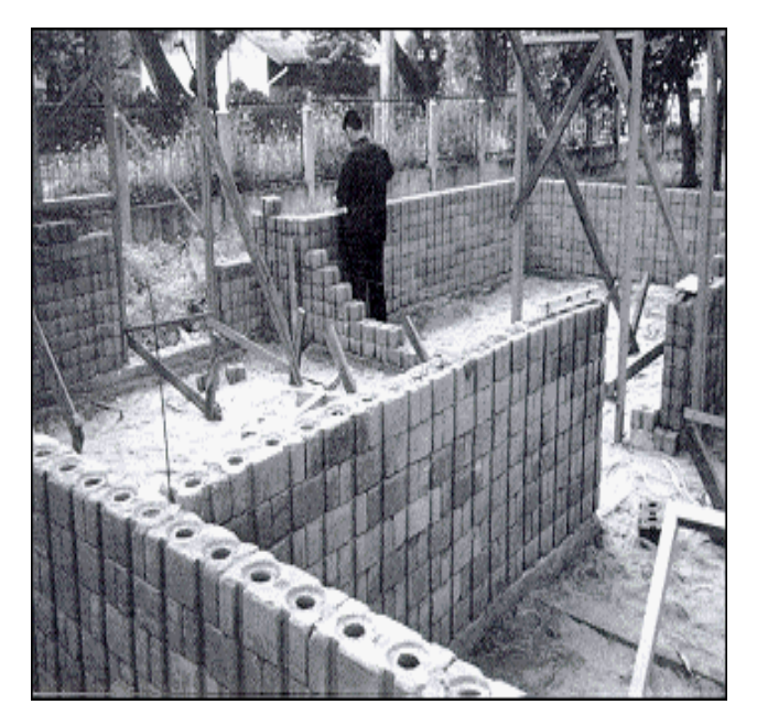
Fig .4 Typical construction site of an interlocking soilcement block house