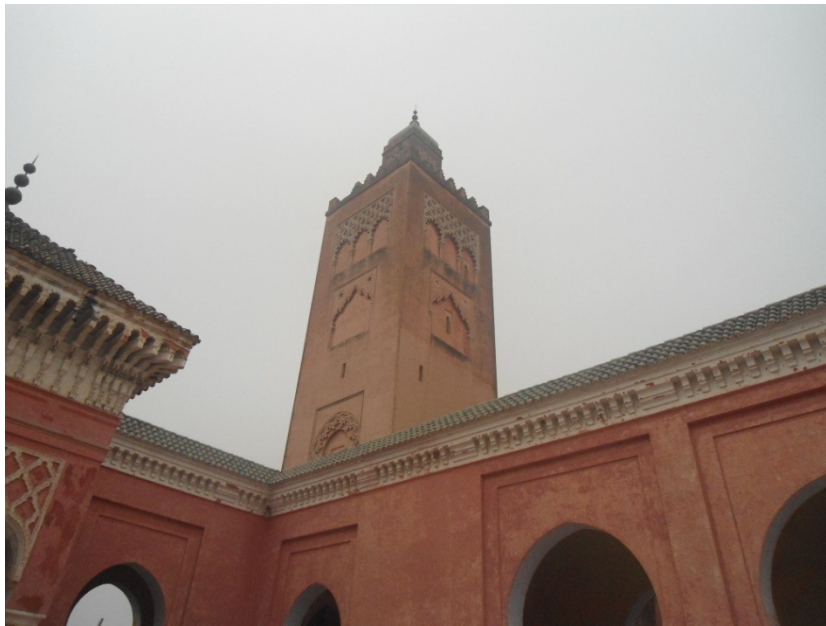
Fig 5: Locally Available Material

3.3 Vernacularism: - To fulfill the social and environmental significance; elements like verandah and courtyard were inbuilt in Moorish Mosque. This had made building more harmonious with nature. Even the use of local materials by artisans have made this building more energy efficient.[FIG 5]