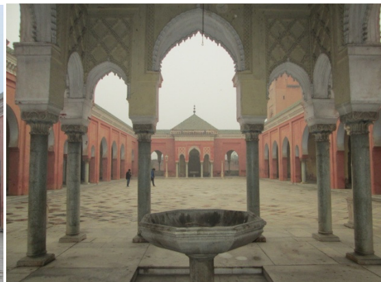
Fig 4:- Courtyard