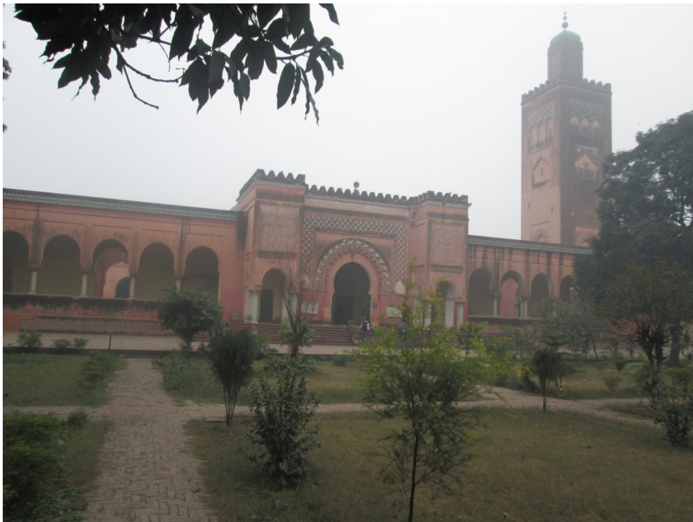
Fig 2: Chahar Bagh Concept