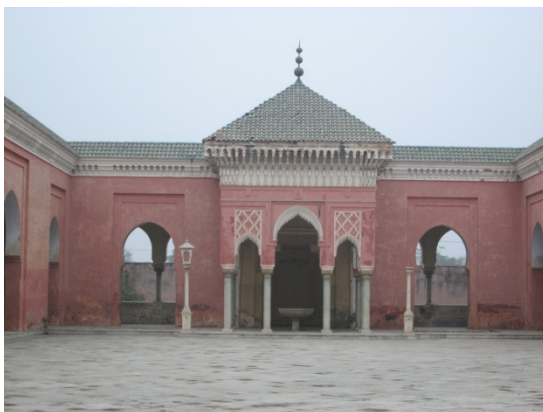
Fig 3:- Indoor-Outdoor Relationship

3.1. Thermal Mass: -Ancient structures have thick walls with highly permissible thermal insulation. The rate by which heat flows is responsible because of temperature difference between the exterior and the interior surfaces. Maximum heat gain by the surface is through outer surfaces but due to large thermal masses the inner surface remains cool. By providing the shading devices on the exterior masses heat can also be controlled by transmitting to the interior zone. As it happened at daytime.